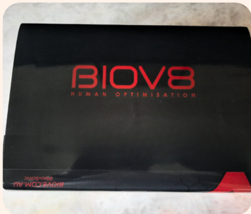
The kit box