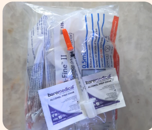
Syringes and swabs